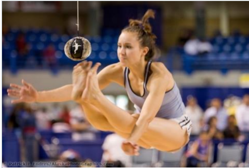
One Foot High Kick & Two Foot High Kick: Elders report that these kicking games were used to signal a successful or unsuccessful whale hunt.