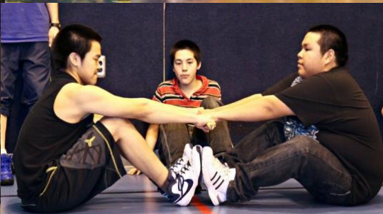
Eskimo & Indian Stick Pull: These strength and endurance games represent grabbing a slippery salmon and pulling a seal out of the ice